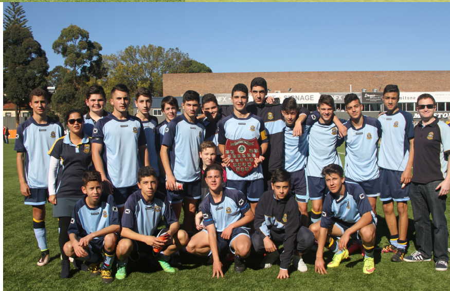
Photos from Under 15 Football Finals