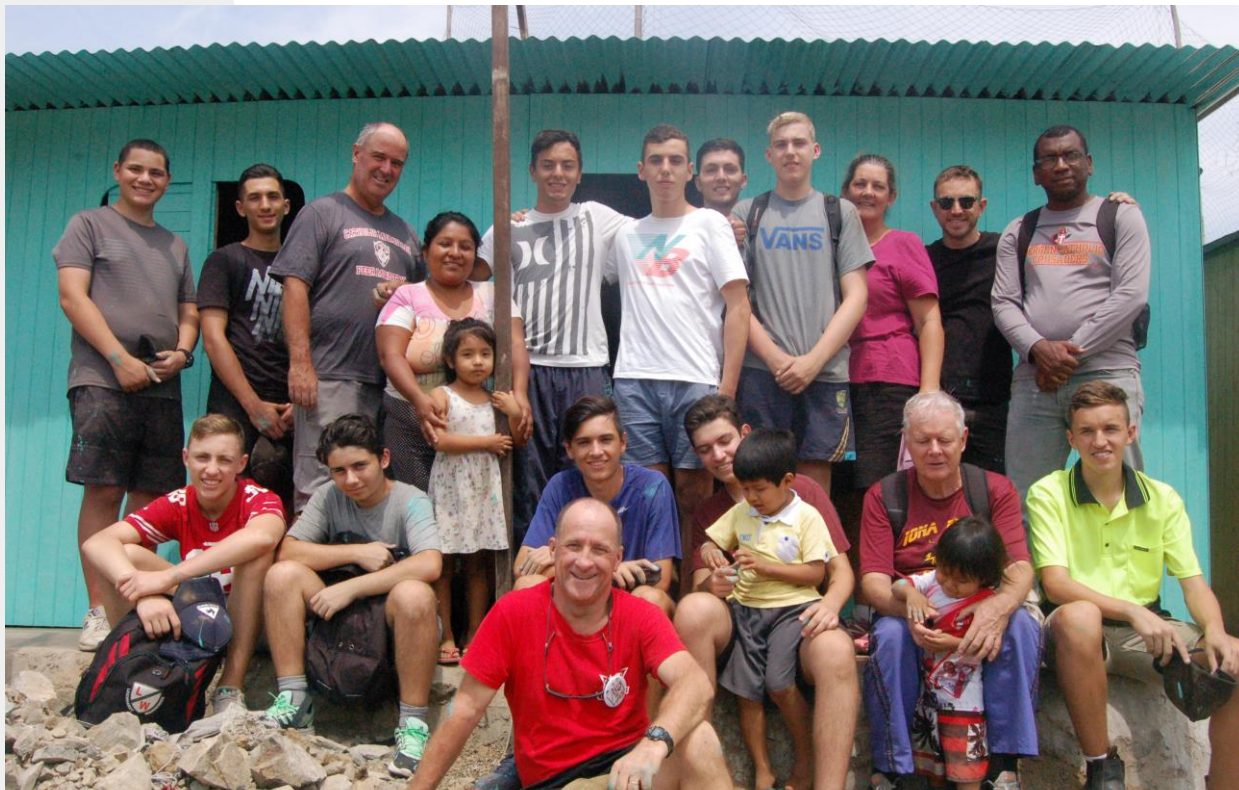
Tour group with the house they built along with the family that will move into the house and the Christian Brothers based in Peru