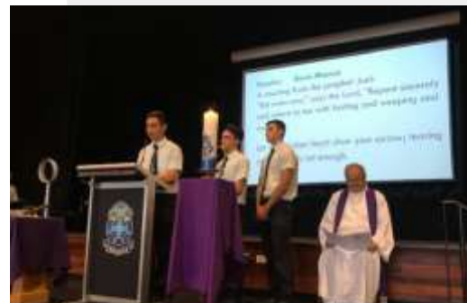
Ash Wednesday Liturgy, 6 th March